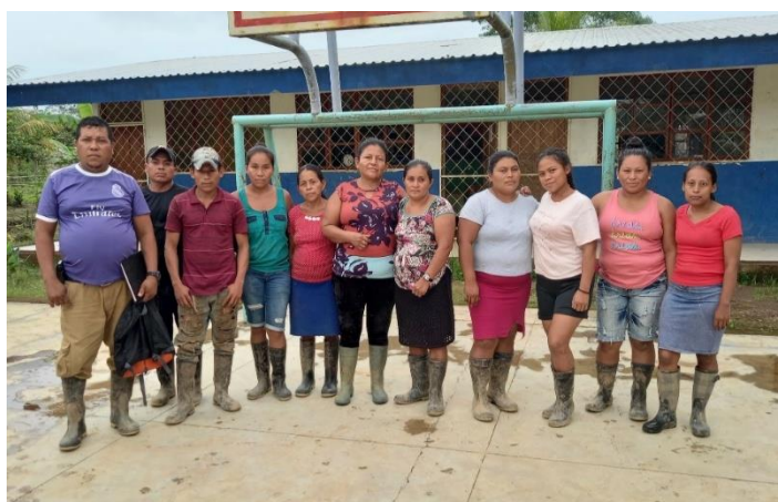
SAHTOSO Monitoring Committee, Amak community