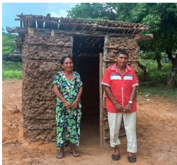
Another family in Panerrakat II, who are almost finishing the construction of its toilet with brick, mud and Yotojoro. They mention that they are very motivated to start using it.