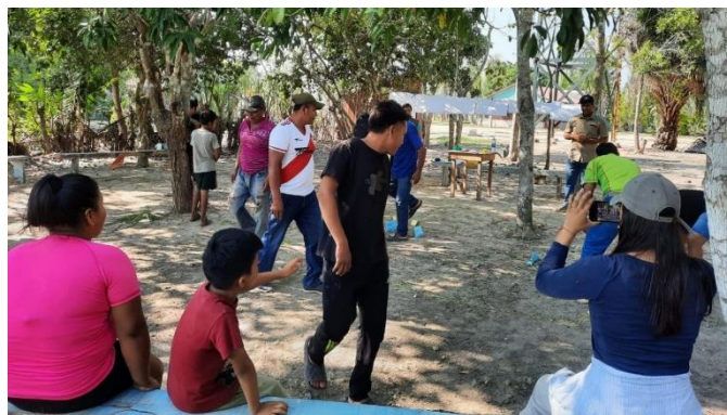
Triggering in community Nuevo Egypt, Yarinacocha