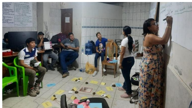
Step 3 Practices, Triggering