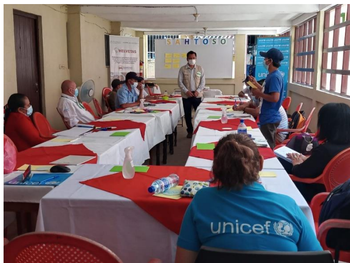
Participants in the SAHTOSO workshop in San José Bocay.

As part of the implementation strategy, a five-day face-to-face workshop was held in Pucallpa, with the participation of UNICEF staff, Peru's Regional Directorate of Housing, Construction and Sanitation (DRVCS), and local facilitators. This workshop was the starting point to form a team of local facilitators trained in the necessary competencies for the implementation of SAHTOSO.