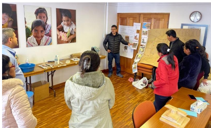
SAHTOSO Monitoring Committee, Amak community