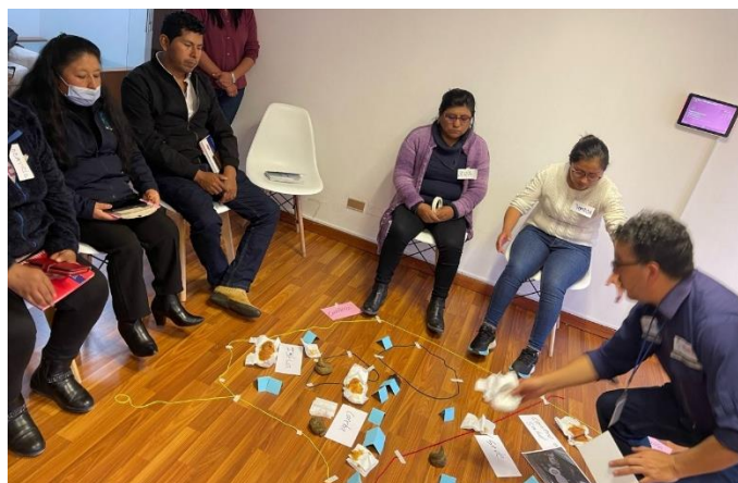
Dramatization on Triggering (step 3 SAHTOSO)