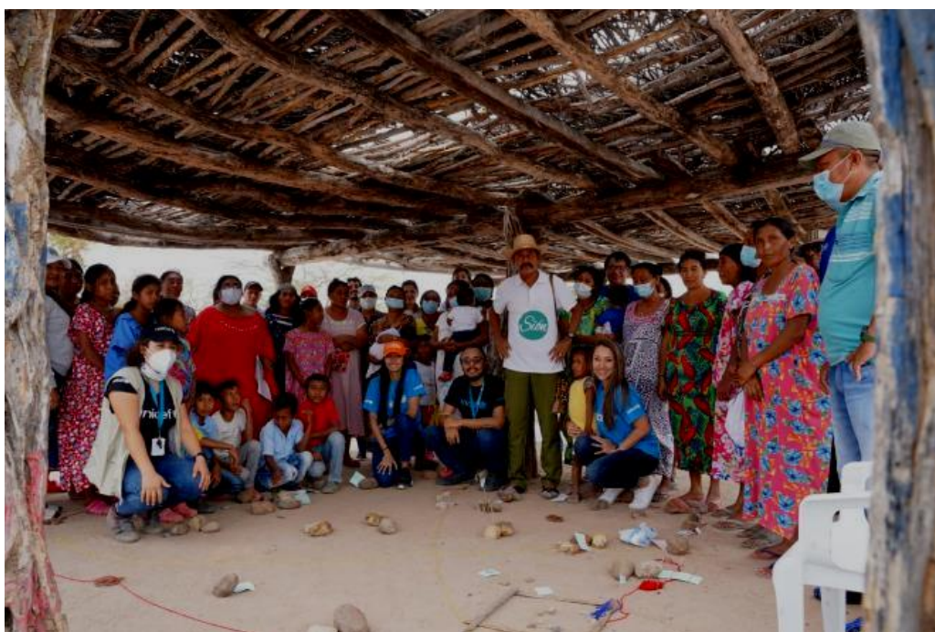
Panerrakat Community with UNICEF and Halu Foundation teams.