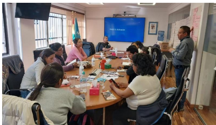
Participants during the development of the SAHTOSO workshop.