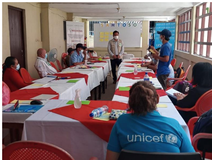
Participants in the SAHTOSO workshop in San José Bocay.

Based on Helvetas' experience, advice is provided on the methodological process that includes reflections on contextual adaptation in the Alto Wangky territory, in San José de Bocay, understanding and respecting the social, cultural and other characteristics of the communities and needs/priorities for intervention.