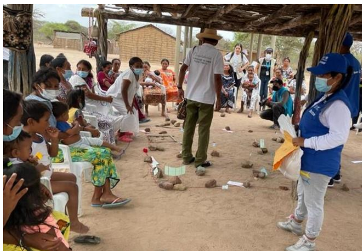
Panerrakat Community Triggering Practices.