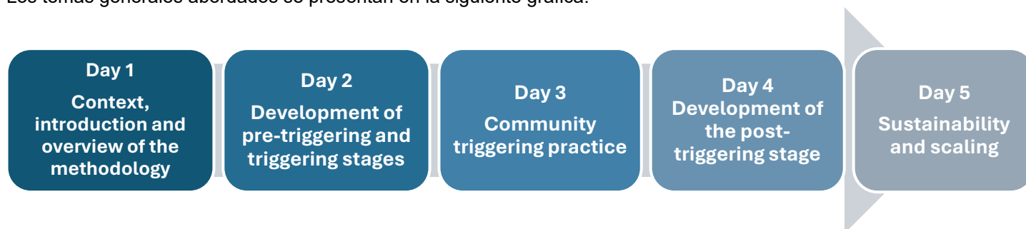
Graphic: Development of the SAHTOSO transfer workshop

Los temas generales abordados se presentan en la siguiente gráfica: