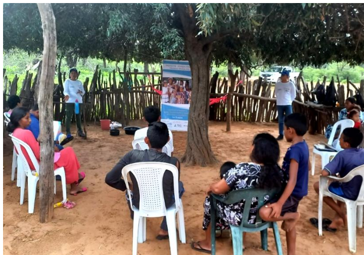
During the development of step 6 of the SAHTOSO methodology in the Asainapo community.