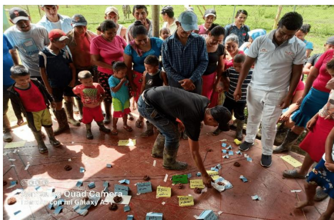
Level of participation of men, women and children in Triggering