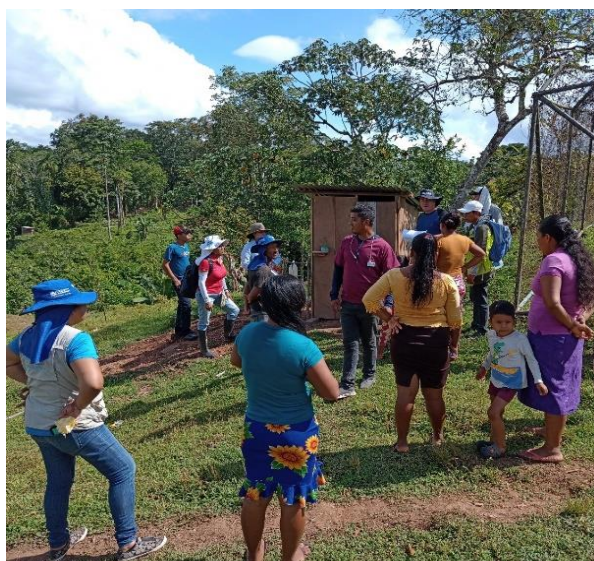
Visit to homes in accompaniment of the Municipal Verification Committee.